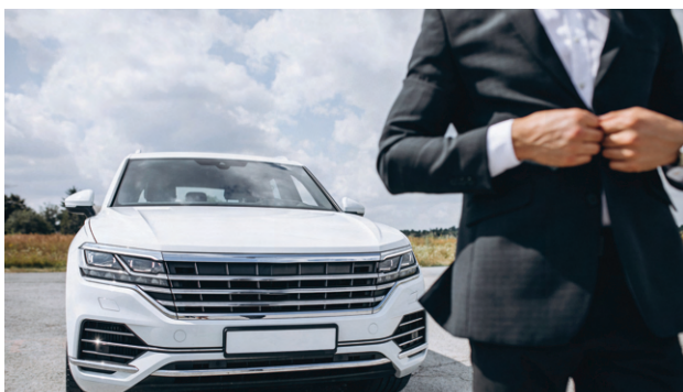
➤ Car Loan

Business loan products are designed for individual customers who wish to use for business start-up, business expansion, which is in line with our institution's mission to increase income and people's livelihood.