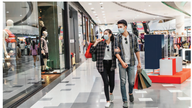
➤ Personal Loan

Student loan products are designed to meet the needs of clients who are students and wish to continue their studies but are unable to do so due to the cost of tuition fees, so this type of loan is a real need for them to continue their studies.