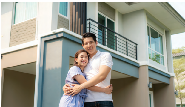
➤ Housing Loan

Business loan products are designed for individual customers who wish to use for business start-up, business expansion, which is in line with our institution's mission to increase income and people's livelihood.