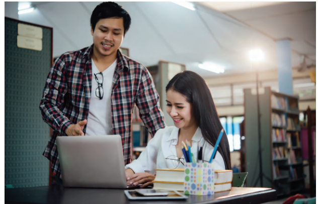
➤ Student Loan

Car loan products are designed to meet the needs of customers who need to use their own car or for the family, they can apply for this type of loan easily and quickly.