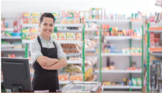
➤ Business Loan

Business loan products are designed for individual customers who wish to use for business start-up, business expansion, which is in line with our institution's mission to increase income and people's livelihood.